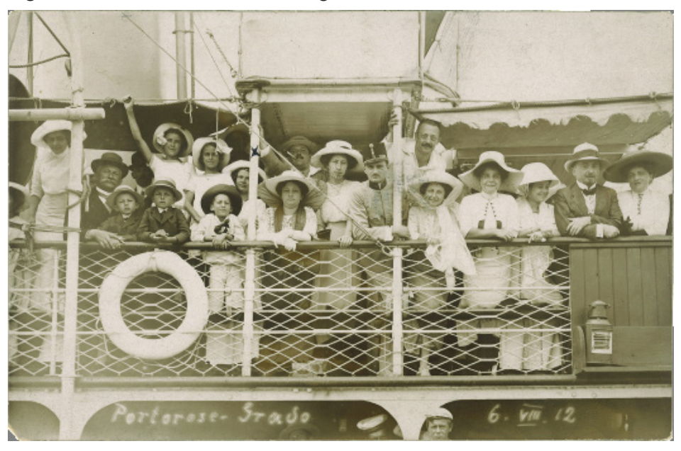
Figure 1: Excursionists on boat, 6 August 1912<sup>16</sup>

with its ships carried out the so called "tram traffic" among Koper/Capodistria, Ankaran/Ancarano, Valdoltra and Trieste; (c) Società di Navigazione a Vapore Istria – Trieste with its seat in Trieste , founded in 1886 by Alesandro Cesare, dominated the Istrian lines traffic.